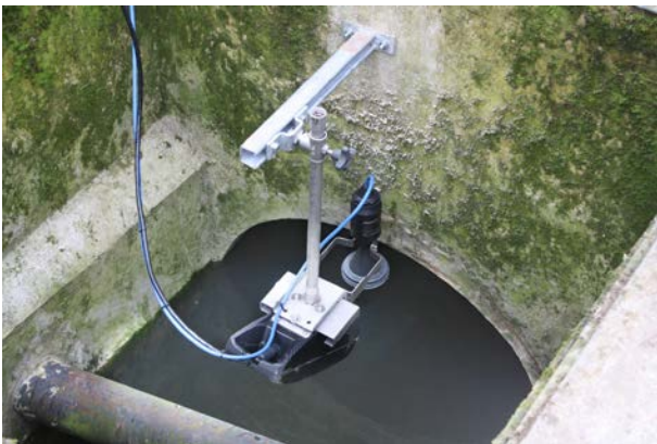
RAVEN-EYE® with radar level sensor